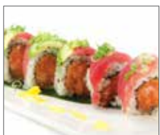
Las Vegas Roll